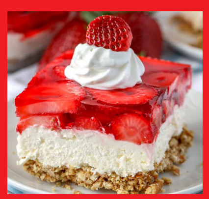
Strawberry Pretzel Salad

Looking for a new summer dessert to try out? Strawberry Pretzel Salad is a simple, yet delicious combination of salty and sweet. Served cold, it can cool you off on the hottest of summer days. Visit CHELCO.com/recipes to learn this awesome dessert!